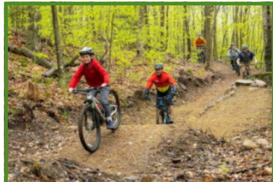
Mountain Bike Trails and Terrain Park